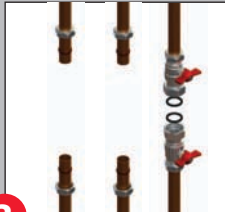
2 Fit valves