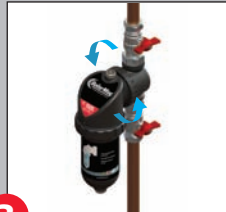
3 Fit BoilerMag